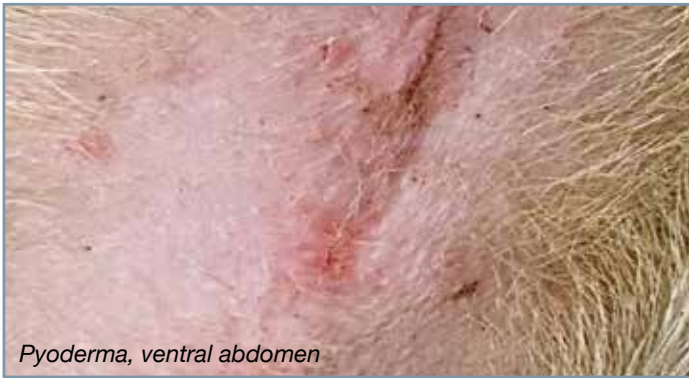
Pyoderma, ventral abdomen

Chlorhexidine has also been used in combination with miconazole with good efficacy against Malassezia pachydermatis . 3